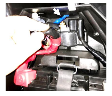
Re-torque all the fasteners after 100 miles.

Your install is now complete! Thank you for choosing Baja Designs.