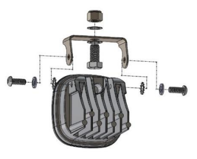
Note: 3/8" bolt must be placed into the bracket before the light.

14. With the 9/16" wrench and socket, mount the lights onto the brackets as shown in the driver's side picture below. Repeat steps for the passenger side. Remove harness attached to the front facia and set aside. It will not be reused.